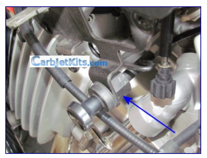
Slide the choke knob with cable out and let the choke cable bracket hang. remove the 2 screws from the throttle cable assembly and take the cables off as shown below.