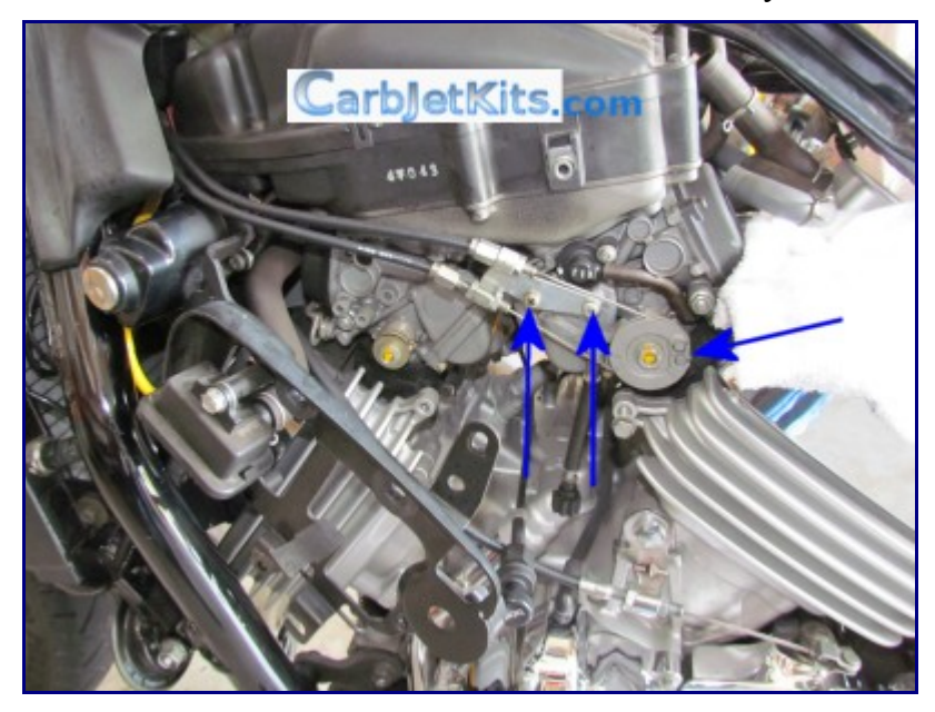
When done it should look like in the image below.