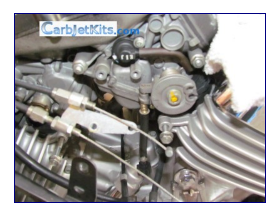
remove the 2 screws that hold the air intake snorkel. there is one on each side.