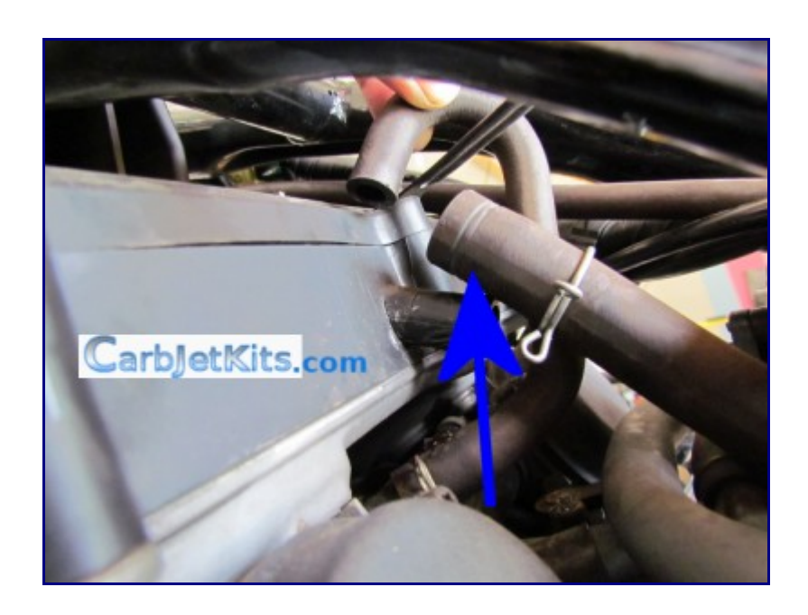
locate the fuel valve diaphragm.